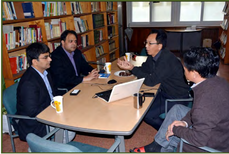
A view of meeting between PCSW&HR's delegation and Woori Technology Institute (WTI) Executives at Seoul Korea