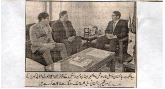
سیالکوٹ، پاکستان کونسل فار سوشل ویلفیئر اینڈ ہیومن رائٹس کے چیئرمین ایجاز نوری جنوبی کوریا کے دورے کے موقع پر پاکستانی سفیر شہباز ملک دو دیگر سفارتوں سے ملاقات کر رہے ہیں

پاکستان دہشت گردی کے خاتمہ کیلئے اپنی کوششیں جاری رکھے گا: شہباز ملک ہمیں تمام امن پسند قوتوں، اقوام اور ممالک کا تعاون درکار ہوگا سیالکوٹ (نامہ نگار) جنوبی کوریا میں پاکستان کورین تنظیم کے پراجیکٹ آفیسر مسٹر کیو سٹنگ پر مشتمل وفد کے قیام کا مقصد شہباز ملک نے کہا ہے کہ پاکستان اپنی جتنی کوریائی سفارت خانے میں بائ سز میں سے دہشت گردی اور انتہا پسندی کے خاتمے کے لیے اپنی تمام تر کوششیں جاری رکھے گا اور اس کے لیے کوریائی سفارت خانے میں پیدائشی دہشت گردی کے خاتمے کے لیے اپنی تمام امن پسند قوتوں، امن سے محبت کرنے والی کے تعاون سے فائدہ حاصل کیا جائے گا اور معاشرے میں مثبت اقوام اور ممالک کا تعاون درکار ہوگا تاکہ دنیا کو امن کا رنگ لائے اور تہذیبوں میں امن لائے۔ انہوں نے کہا کہ بدلتے گہوارے بنایا جائے تاکہ کوریائی دہشت گردی اور امن کے لیے ہونے والی حالات میں جہاں ممالک کے درمیان تجارت دہشت گردی اور انتہا پسندی کا ناقصہ ضروری ہے۔ ان اور دیگر سفارتوں میں تعلقات کا فروغ ضروری ہے وہاں دنیا خیالات کا اظہار انہوں نے جنوبی کوریا کے دورے پر اپنے میں قیام امن اور سماجی ترقی کے لیے کوریائی سفارتوں کا ہونے متعلق اپنی جی او کے تجزیاتی ممبران اور قیام امن اور سماجی ترقی کی اہم ضرورت ہے۔