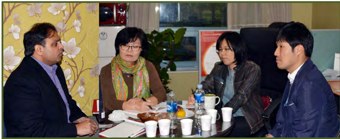
A view of meeting between PCSW&HR delegation and Executive Director of Asia Women Bridge Korea