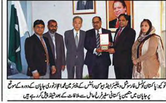
ٹوکیو: پاکستان کونسل فار سوشل ویلفیئر اینڈ ہیومن رائٹس کے چیئر مین ہمارا چانزٹوری جاپان کے دورہ کے موقع پر جاپان میں صحیحین پاکستانی سفیر فرخ عالم سے ملاقات کے بعد شیلڈ پیش کر رہے ہیں

پاکستان عالمی امن کے لیے اپنا کردار ادا کرتا رہے گا فرخ عالم نیروٹھی سے جیت کر دی اور اپنی پستی کے لیے اپنا کردار ادا کرتا رہے گا فرخ عالم پاکستان کے لیے دنیا میں امن کے لیے اپنا کردار ادا کرتا رہے گا فرخ عالم پاکستان کے لیے دنیا میں امن کے لیے اپنا کردار ادا کرتا رہے گا فرخ عالم