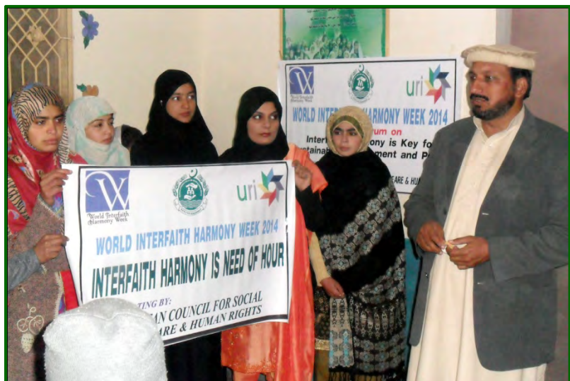
A view assembly session to celebrate the WIHW 2014 at one of Private School