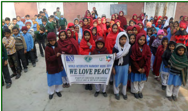
A view assembly session to celebrate the WIHW at one of Govt. School

To celebrate the WIHW in more than 1800 government and private schools (male & female) situated at Sialkot district from 4 -9 February 2014 during the assembly session at each school special activities were arranged to aware the students, teachers regarding the concept and importance of interfaith & intercultural harmony and more than 300,000 students and teachers were aware about the importance of interfaith harmony