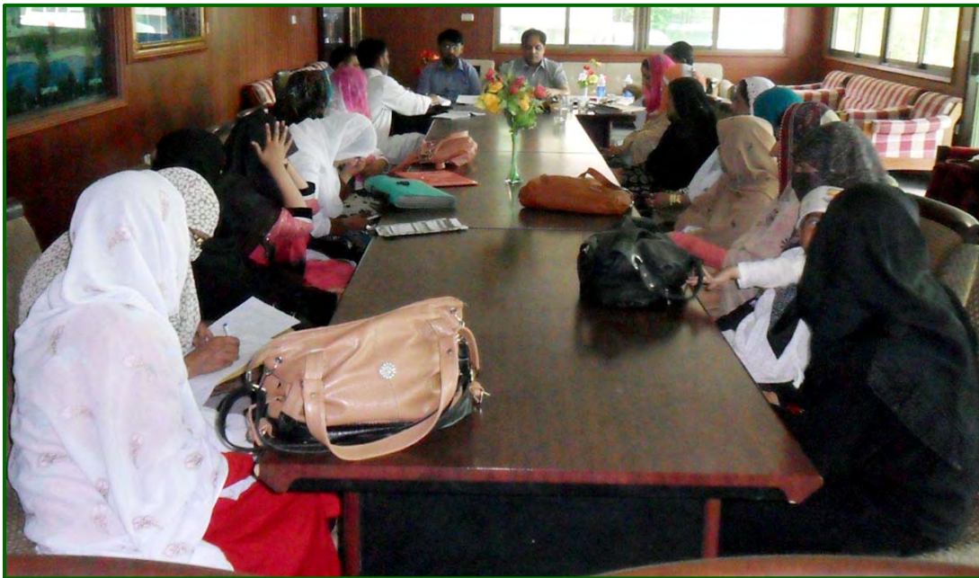
A view of orientation session for female to celebrate the WIHW 2014 by PCSW&HR

On 3 rd February 2014 PCSW&HR also held orientation session of female teachers working at the vocational training centres of PCSW&HR and build their capacity about the concept of interfaith & intercultural harmony.