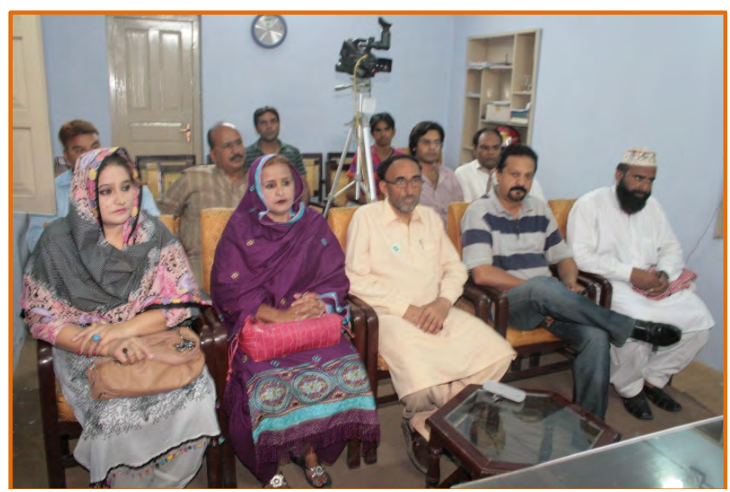
A view of speaker's Gallery during the ceremony

This shameful and brutal attack on the Church has united the whole Pakistani nation and this is good time to fight against the mindset of extremism and terrorism in Pakistan with the strengthen of mutual relations, equality and self respect of each other's and as well as to sensitize and motivate the Pakistan youth and students against the mindset of extremism and terrorism to create the culture of peace, equality, justice and human dignity & rights in Pakistan as well as at global level. The speakers of ceremony also said that we can only bring radical change with giving the proper guidance and counseling to the youth and student.