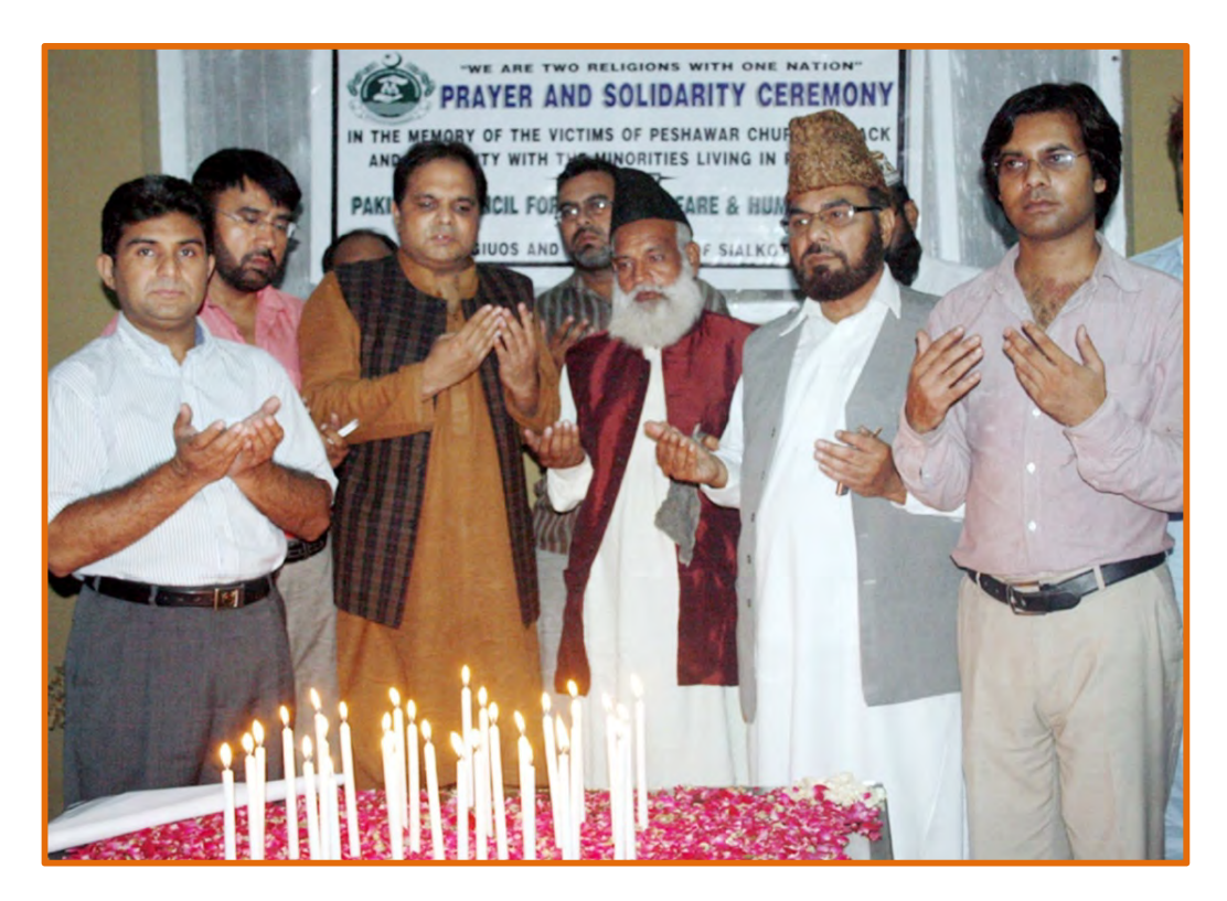
Prayers are being offered after the lighting of candles during the ceremony