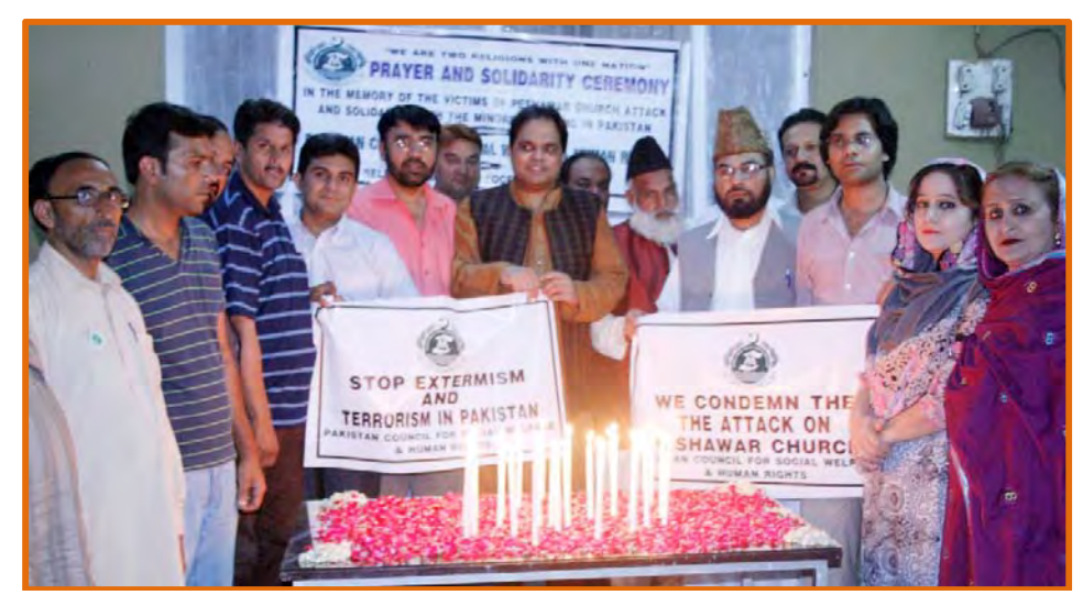
Candles are being lighting during the Prayers and Solidarity Ceremony

At the end of the ceremony candles were lighting in the memory of those innocent people died during the suicide attack at Church and also to show solidarity with the Christian community. Prayer was also offered for the departure soul of died people and prevailing of peace in Pakistan and throughout the world. The ceremony was published by the all National Newspapers and all TV channels highlighted this ceremony in their news bulletin.