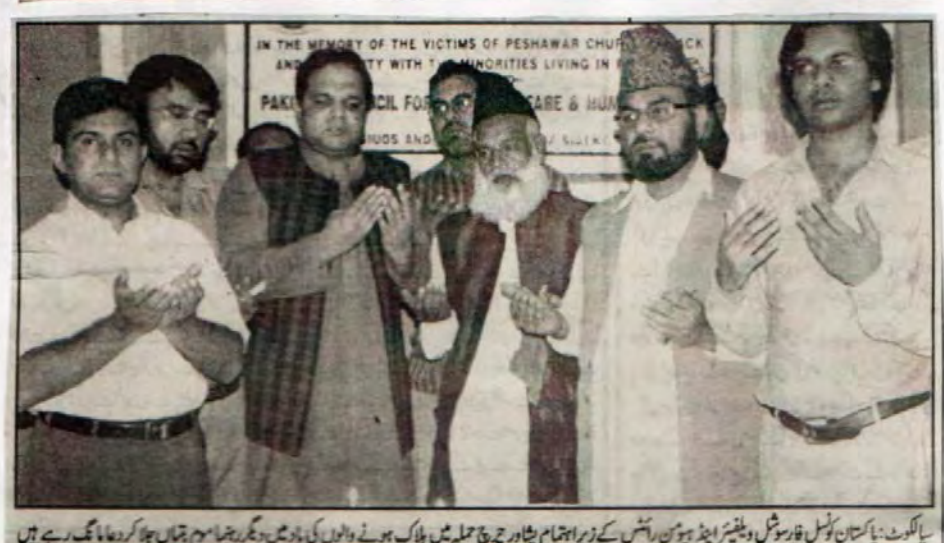
یا لکوٹ نیاکتان اُول فارسوش ویلیٹر ایڈ ہواں رائش کے در اہتمام بٹاور چری حمد ش بلاک ہونے والوں کی بادی دیکر بھاسم بتیاں جا کردھا انگ رہے ایل