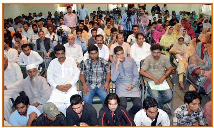
A view of participants during the ceremony

They further said that attack on a church was an act of terrorism and a conspiracy against Islam and Pakistan, Islam is religion of peace, justice, and teaches us the respect of all religions and their followers provides full protection to the minorities in Islamic state and there is no room for the blood shedding and prejudice with non Muslims in the name of religions. By promoting interfaith & intercultural harmony, social & religious tolerance, self respect we may eliminate the terrorism and extremism from Pakistan.