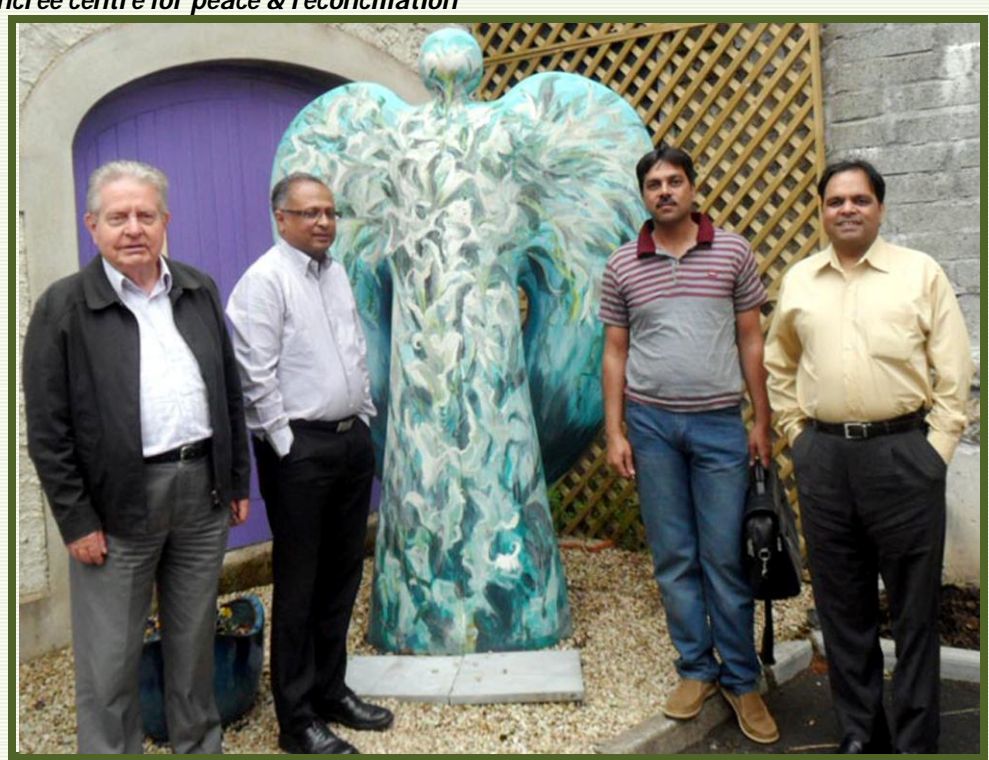
PCSW&HR delegation during their visit to Glencree centre for peace & reconciliation Ireland