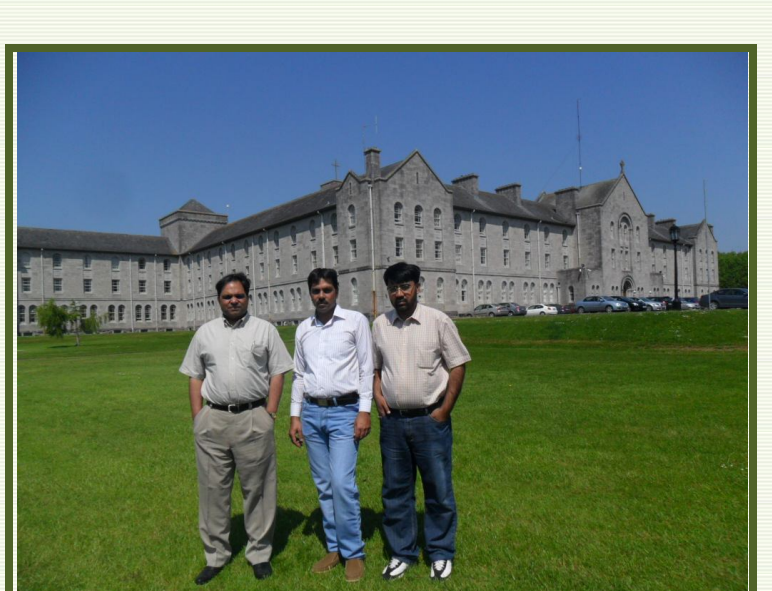
PCSW&HR's delegation during the visit of St. Columbian Mission Dalgan Park Ireland