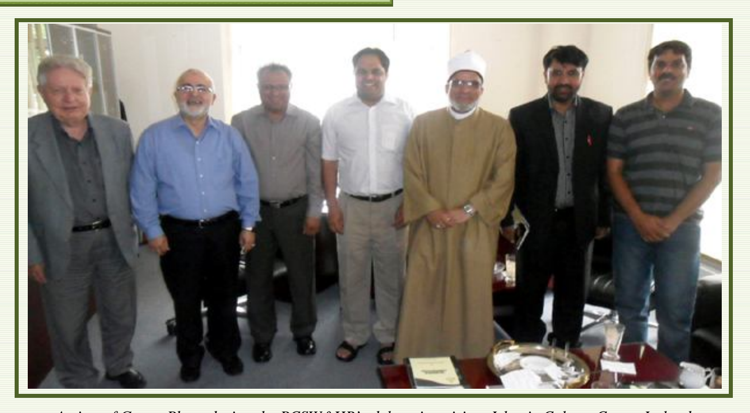
A view of Group Photo during the PCSW&HR's delegation visit to Islamic Culture Centre Ireland