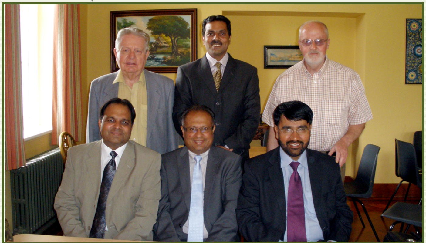
A view of group photo of PCSWHR's Delegation with the St. Columbian Missionaries officials at Dalgan Park