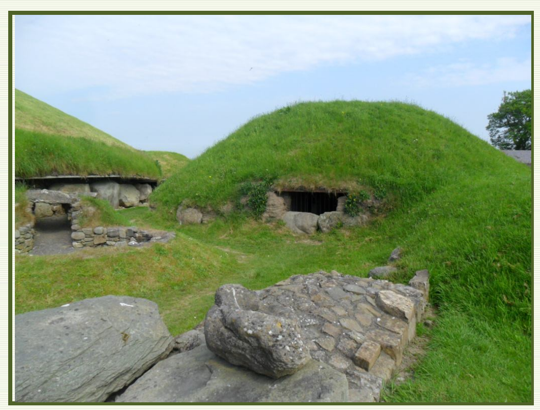
Tombs of Knowth