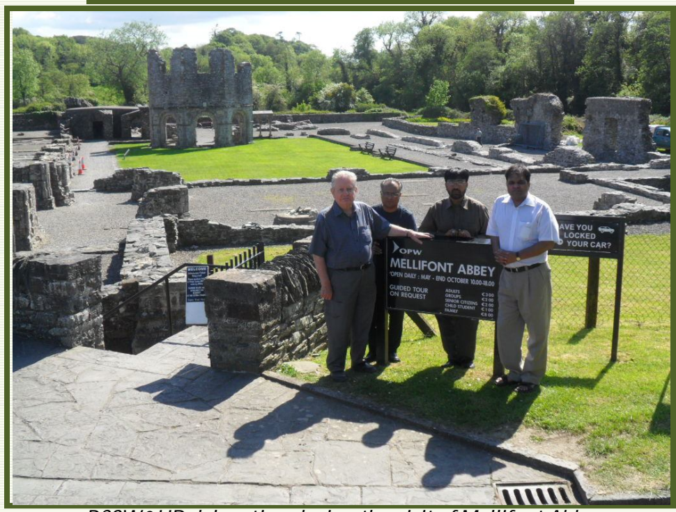
PCSW&HR delegation during the visit of Mellifont Abbey