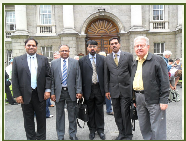
PCSW&HR delegation during the visit of University of Dublin Trinity College Ireland