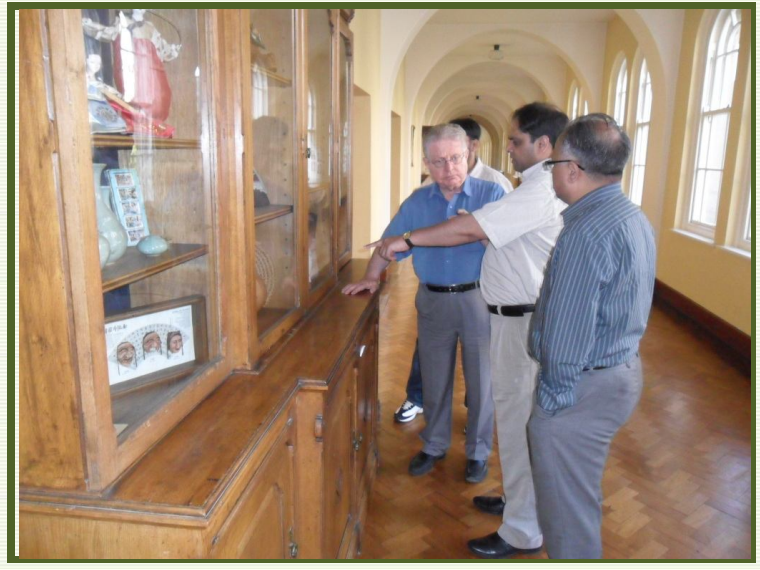
PCSW&HR's delegation visiting the Dalgan Park