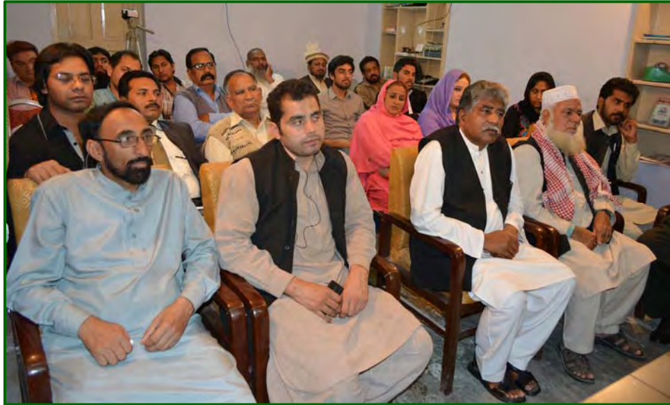
A view of participants during the peace prayer ceremony organized by PCSW&HR in remembrance of Christian Couple

The speakers further said that due to continuous activities of terrorists and extremist mind set Pakistan is becoming unsaved country for the religious & cultural minorities so it is need of hour to made Pakistan as per the vision of Quaid-e-Azam Muhammad Ali Jinnah, parliament should legislate and amendments new constitutional framework to protect the rights of minorities in Pakistan so that lives and properties of religious & cultural minorities and week groups from terrorists and extremists mindset people.