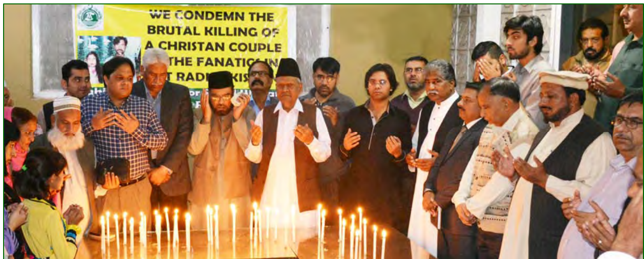
Prayers are being offered after the candles lighting for Christian couples during the Peace prayer ceremony