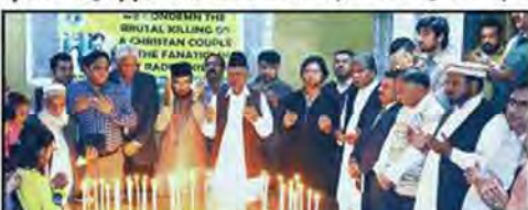
پاکستان کونسل فار سوشل ویلفیئر اینڈ ہیومن رائٹس کے زیر اہتمام راکوٹ میں منعقد کیے گئے اجتماع کی تقریب

راکوٹ (دھرتی نیوز) انجمن پندرہ طاقت ور، عالم طاقت اور گورنمنٹوں کے جان و مال کو جان آزار اور بھرانہ سوچ کے حامل طاقت کی کارروائیوں کے باعث پاکستان دشمنی و مافی کیوں اور گورنمنٹ کے لیے غیر موثر ملک بنا رہا ہے۔ پاکستان کو اسلامی تعلیمات اور تقاضا کے مطابق ملک بنانے کے لیے اس ضروری ہے کہ پاکستان کونسل فار سوشل ویلفیئر اینڈ ہیومن رائٹس اور فور ایجنٹوں کے حقوق کے تحفظ کے لیے سخت اقدامات اور کارروائیوں میں زور دیا جائے جس سے گورنمنٹ اور سوشل ویلفیئر اینڈ ہیومن رائٹس کی کوٹ راجائن میں منعقد ہونے والے سنی جوڑے کے شرکاء اور گورنمنٹ کے مخالفین کی شرکت کی ضرورت ہے۔