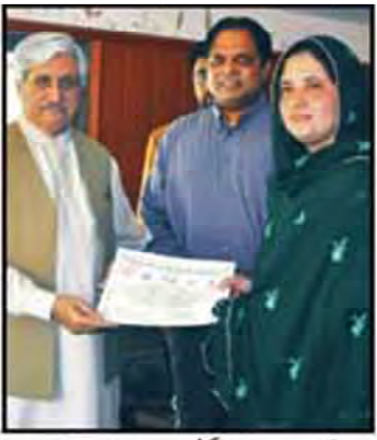
رادلاكوث، مدرآ زاد تشمير رداريعقوب پاكتان كونسل كي بوزيش جولدركوش كيث دے دے إلى