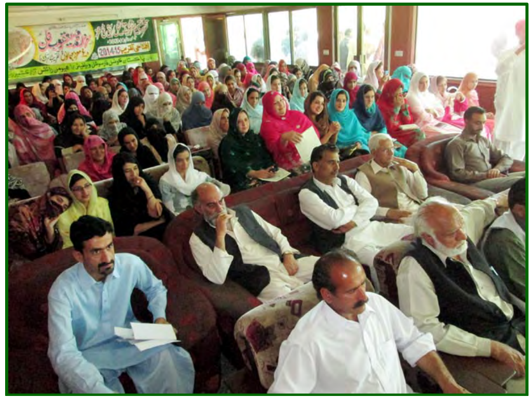
A view of Participants during the Project Launching and Certificate Awarding Ceremonies

national and international policy making and activities of social life. Nations cannot achieve their development goals if their women are discriminated. Women's empowerment is in fact necessary condition for socio-economic development of a country. He further said that women in most part of Pakistan are not enjoying the fundamental human rights. They are less healthy, less nourished and more vulnerable than men.