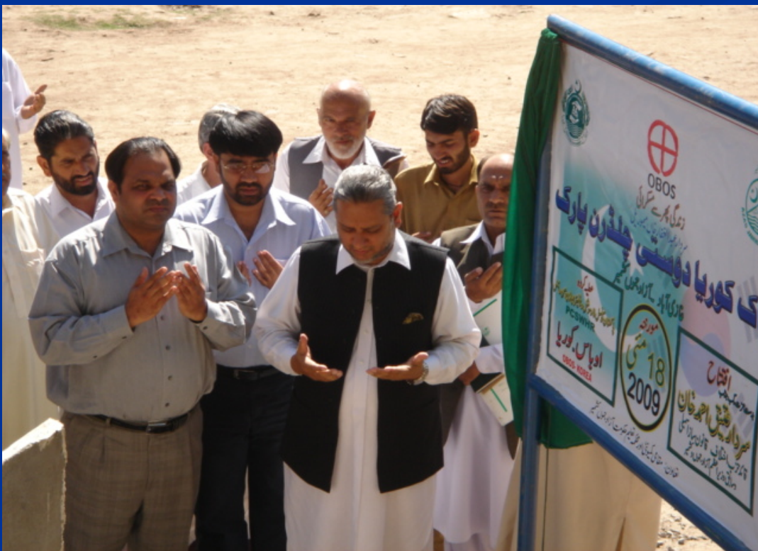
A view Collective Prayer after the Inauguration of Pak – Korea Friendship Children Parks Ghazibad AJ&K