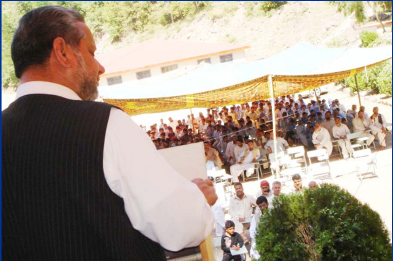
A view of Sardar Attique Ahmed Khan Address during the Ceremony

Sardar Attique Ahmed Khan further added that “Green & Skilled Kashmir” is his vision and Pakistan Council for Social Welfare & Human Rights has really brought this vision into practical by establishing 15 vocational training centres for earthquake-affected women at various parts of Poonch and Bagh Districts of AJ&K. The all projects initiated by the Pakistan Council for Social Welfare & Human Rights for the rehabilitation of earthquake affected population are on grounds and sustainable. He quoted that Pakistan Council for Social Welfare & Human Rights also established the biggest “Mujahid-e-Awal Public Park” at Dheer Kot – AJ&K and I have also honor to inaugurated this biggest public park of AJ&K, now by the grace of God it has been decided that Mujahid-e-Awal Public Park” Dheer Kot will convent into most up-to-date parks of the world. He appreciated the suggestion of Pakistan Council for Social Welfare & Human Rights regarding the start of vocational training in the all Government’s schools for men & women in evening classes.