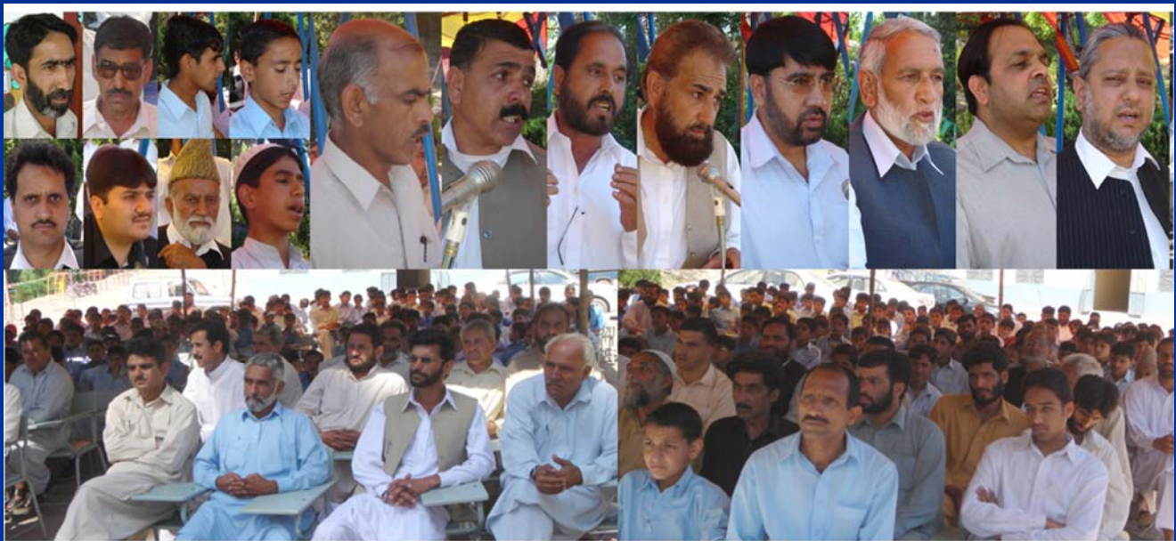
A view of all Speakers and Participants of Inauguration Ceremony of Pak – Korea Friendship Children Parks Ghaziabad District Bagh released for Press

While addressing the ceremony all others speakers accepted the role of PCSW&HR and their Local and International counterparts for the rehabilitation of earthquake victims AJ&K and assured their full cooperation and support to PCSW&HR Officials for their running projects for the suffering peoples of AJ&K, they also said that training on Kitchen Gardening is need of hour and if OBOS launches this project for the people of Kashmir then it will be our actual rehabilitation. They also assured their full cooperation and support to PCSW&HR and OBOS to accomplish their ongoing and future project.