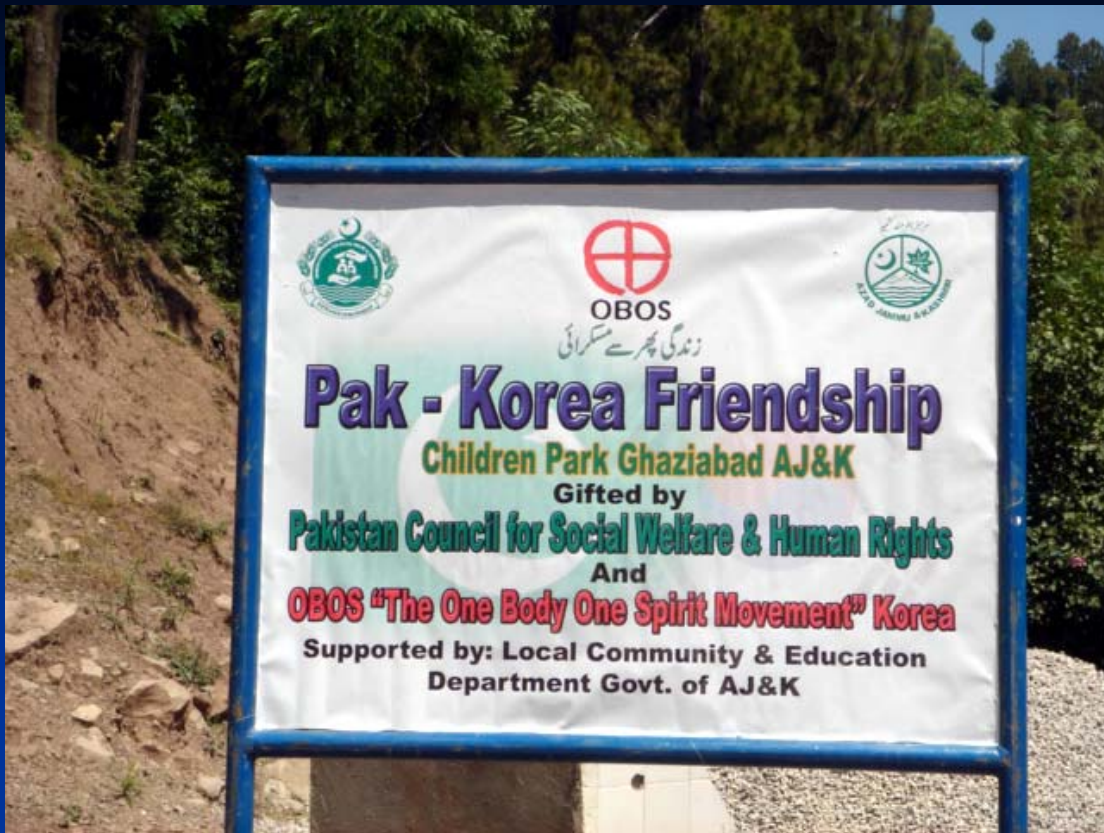
A View of Sign Board of Pak – Korea Friendship Children Park Ghaziabad District Bagh AJ&K