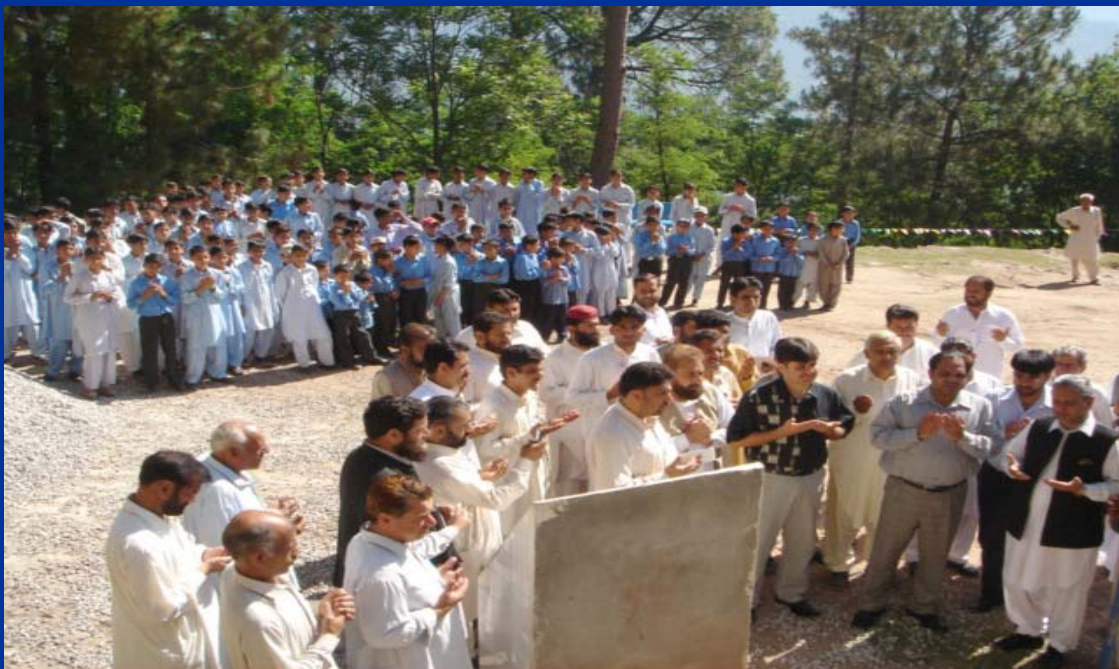
A view of Students of Govt. Boys High School Ghaziabad praying after the inauguration of Children Park in their school