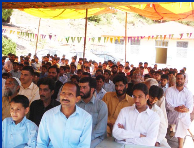
A view of Participants During the Inauguration Ceremony of Pak – Korea Friendship Children Parks Ghaziabad