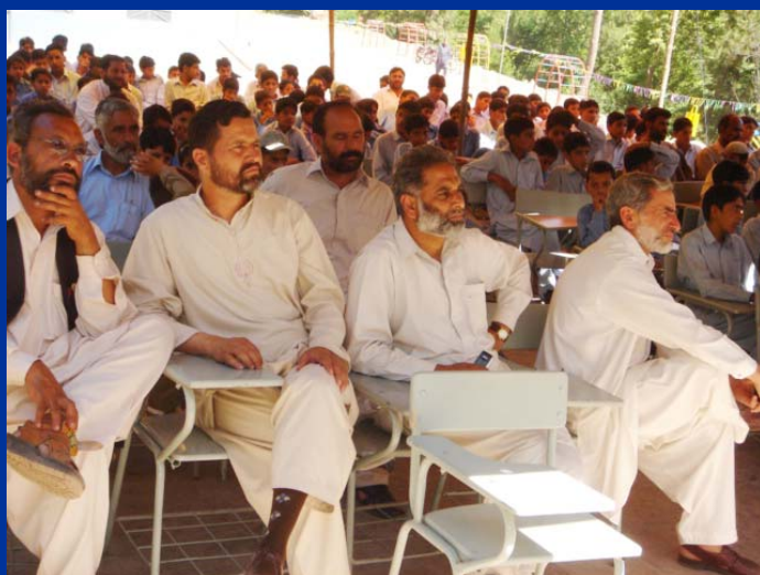
A view of Participants During the Inauguration Ceremony of Pak – Korea Friendship Children Parks Ghaziabad

He lauded the efforts of OBOS – Korea for the promotion of inter –religious harmony/dialogues, social co-existence purely on humanitarian based should be followed by the others. He said that terrorism, extremism is globally issue, and we can only handle this issue through religious harmony, social co-existence, PCSW&HR and OBOS creating religious harmony, co-existence by bringing people close that is surely great service. He added that the efforts done by the PCSW&HR and OBOS could never forget by the Kashmiri. Establishment of children parks/playgrounds for the children is unique demonstration by the PCSW&HR and OBOS in AJ&K. He further said no doubt lot of rehabilitation work has been done for the earthquake affected population but provision of recreation facilities in the Governments schools for the children is example and Government should followed this unique idea presented by the PCSW&HR and OBOS Korea.