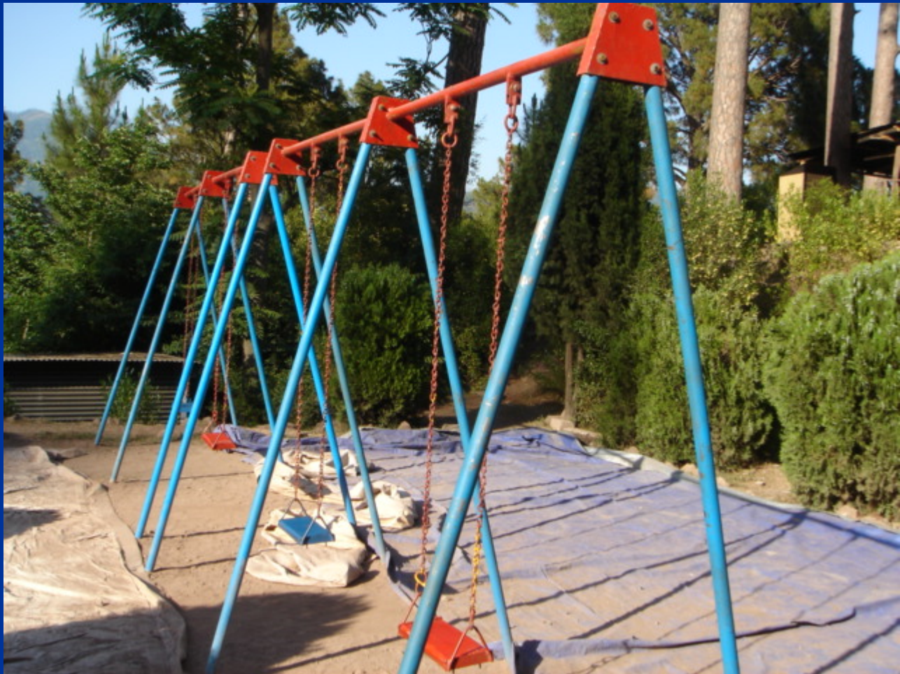
A view of Park Items Installed at Pak – Korea Friendship Children Park Ghaziabad